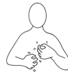
Show tension in hands. Use one or both hands as relevant