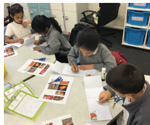
Dove Class enjoyed learning about different religions on our Religion and Worldview Day.