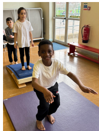
In PE, Sparrow Class enjoyed performing gymnastic routines!