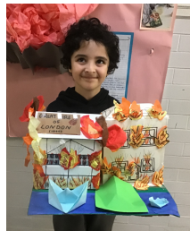
Wren Class's home learning demonstrated creativity.