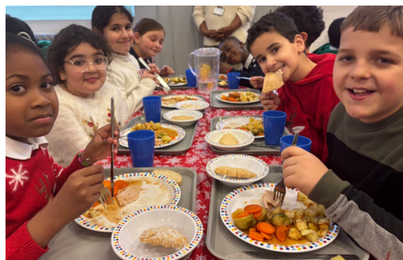
Children enjoying Christmas dinner!