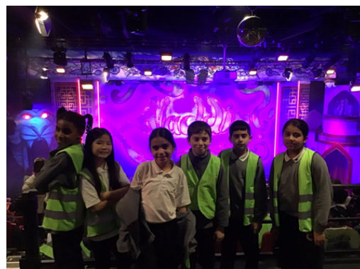
Year Four's visit to the pantomime