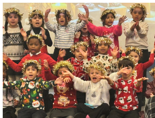
Year One's Festive Singing Concert